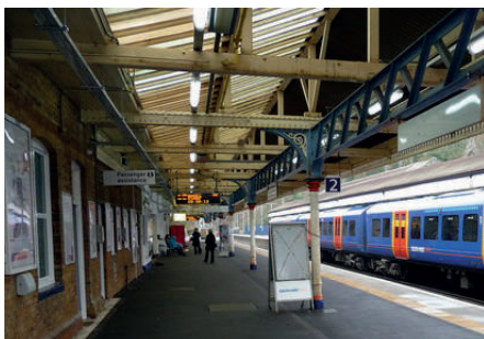
Gordon the blue engine recognised for his free-spirited ‘take it or leave it’ attitude.

A spokesperson for Slow Wet Trains, who was questioned as to why he had won the award said ‘get off our property you slimy bald git’.