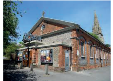
Cinema: Now a truly immersive experience