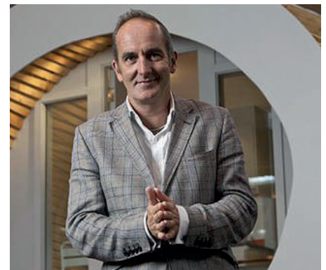
TV’s Macleod “Knock it down.”

TV’s celebrity architect Kevin Macleod from ‘Grand Designs’ is an enthusiastic supporter: