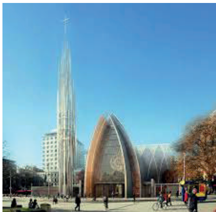
A CAD model of the exciting new design

A consortium of local award-winning architectural firms presented their designs over a year ago for an ambitious re-modelling of the historic site and now town planners are nearing agreement.