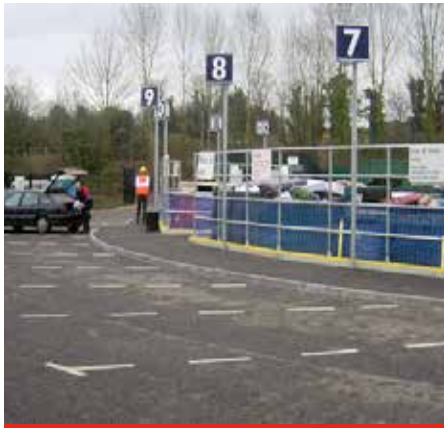
REAL NEWS OR FAKE NEWS @smugw