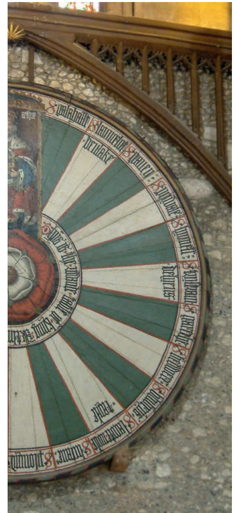
The new semi-circle table

Similar ventures include halving the budget for education, health and most local services, while hoping things don't go tits-up.