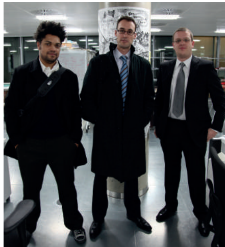
Suited and booted