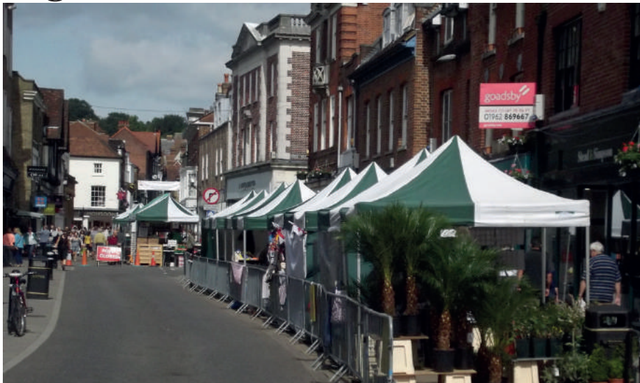
Transnational stalls to be set up in front of street based competitors