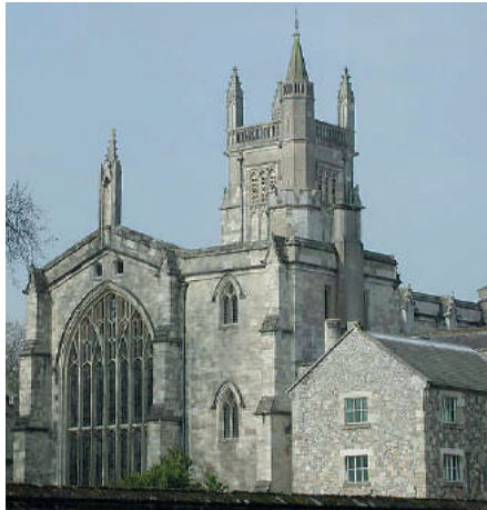
“Egyptian tomb of South-East England”

Researchers eagerly presented their findings at an impromptu press conference last week, but were cut short after an anonymous donation from ‘a concerned and powerful local’ stopped anyone from showing up.