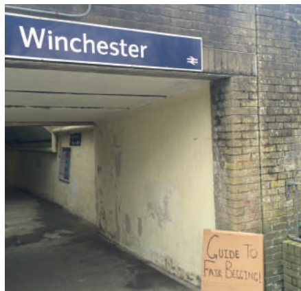
New ‘Guide to Fair Begging’

Included in The Guide is the actual cost of a night in the night-shelter (free if you are not drunk and genuinely homeless),