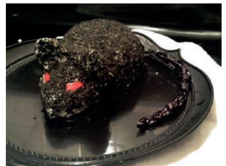
Local delicacy a hit with Chinese

Her friend held her hand and said she thought the whole situation was iwonic.