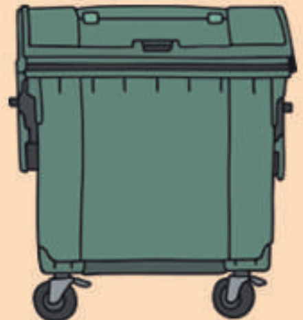
Virtual reality tour prototype

except every other Thursday, when it’s bin day.