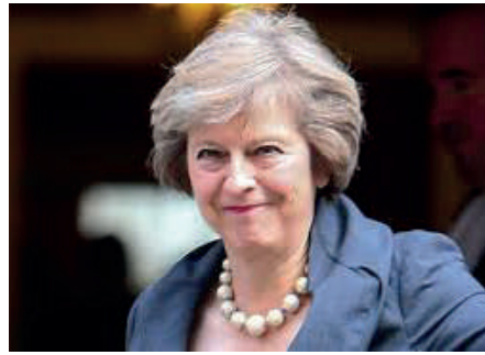
Prime Sucker May

CITY and business leaders were buoyant today following the latest meeting with President Donald Trump and the Prime Minister Theresa May which indicated promise future trade deals with the UK.