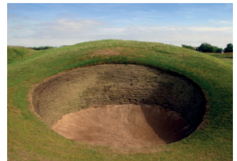
The future for Basingstoke?