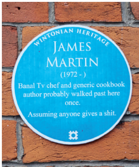
Wintonian Heritage plaque on facade of the Hotel du Vin & Bistro.