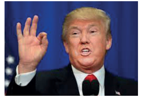
Prize Twat Trump